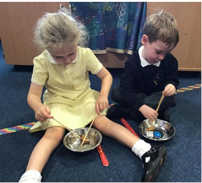
absence. There are two types of absence:

Pupils have had a lot of fun exploring chopsticks and designing their own moon cakes! The children have been so enthusiastic and we look forward to following their progress.