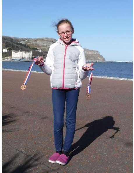
which is the highest award you can earn as a Beaver. Fantastic news for you both!