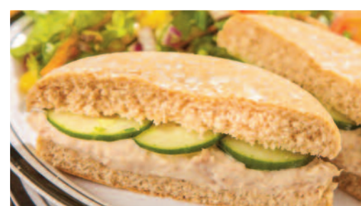
Deli Choice of Breads with a Selection of Fillings Served with a Side Salad

VEGETARIAN VERSIONS OF THE ABOVE MEAL AVAILABLE DAILY