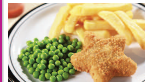
Fish Star (MSC) served with Chips & Peas or Baked Beans

VEGETARIAN VERSIONS OF THE ABOVE MEAL AVAILABLE DAILY