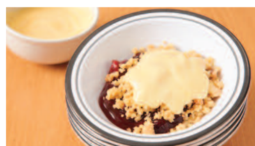
Fruit Crumble & Custard