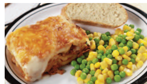
Beef Lasagne served with Garlic & Herb Bread and Seasonal Vegetables