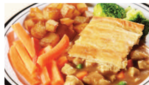
Homemade Chicken Pie served with Diced Crispy Potatoes & Seasonal Vegetables