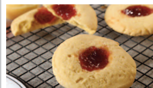
Jam & Custard Biscuit