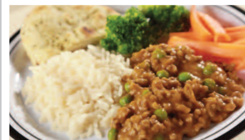
Beef Keema served with Rice, Naan Bread & Seasonal Vegetables